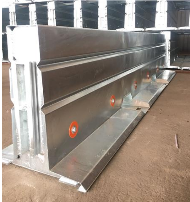
Photograph of Defender 100HC unit